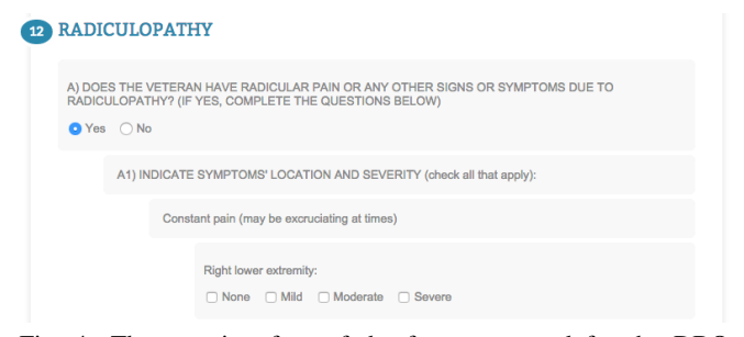
Fig. 4: The user interface of the form generated for the DBQ question corresponding to radiculopathy pain modeled in Figure 2.

question type (e.g., radio, checkbox, dropdown, horizontal checkbox, etc), question-list layout (vertical or inline) and recurrence; one can specify that a collection of questions should be repeated any given number of times. Some more complex options include overriding the default (alphabetic) order of answer options, and triggering sub-questions when a specific answer is selected. These two features are exemplified in Figure 4: this question is configured with an attribute/value pair: showSubquestionsForAnswer="cfa:Yes" on the question XML element, so that answering 'Yes' triggers the sub-questions of that question. In Figure 4, under 'Right lower extremity', we have a question with a list of answer options derived from an enumerated value set, which would ordinarily be ordered alphabetically. However, 'None' would then appear between 'Moderate' and 'Severe', thus interrupting a severity scale. So we added: optionOrder="3;*" to the question element, which states that the would-be third option (alphabetically) should appear first, and the remaining (the "*" wild character stands for "all unmentioned options") should be presented in default order.