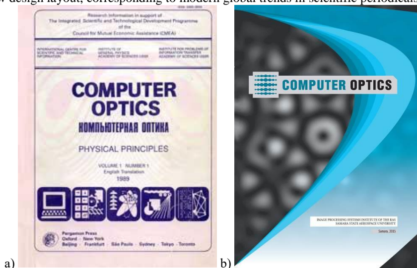
Fig. 2. The covers of the English language issues of " Computer Optics ": a) version of 1989; b) special edition of 2015.

After 25 years the editorial board decided to resume production of " Computer Optics " in English at the expense of own means and resources. At the end of 2015 there was the release of a special English-language edition of " Computer Optics " (Figure 2), which included 22 articles published in the Russian version of the journal over the past two years. "Selected papers" became the first attempt of the journal edition for the foreign scientific community. For this aim the editorial board of the publishing department was expanded, and specially for " Computer Optics " has been developed a new design layout, corresponding to modern global trends in scientific periodicals.