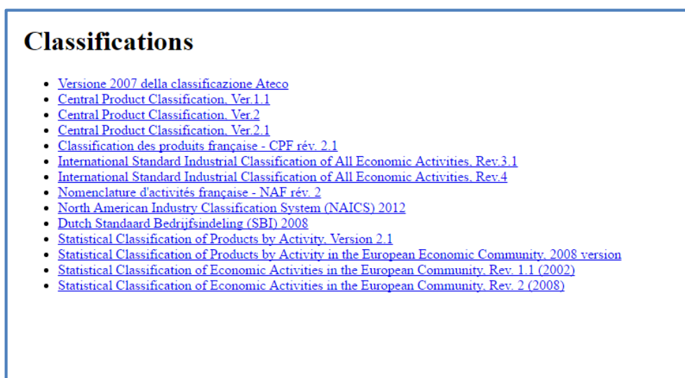
Figure 1: Overall list of available classifications

The Classification Explorer also has a search function. Given a code of a classification item or a text to search, the functionality returns all the matching classification items for all the classification that are in the database. The results are grouped by each classification they belong to (see Figure 4).