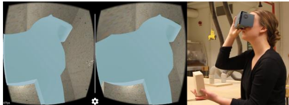
Figure 4: View from the inside of the carving block