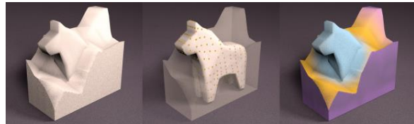
Figure 2: Left: Cut out of the 3D printed material, middle: guiding dots at the surface of the horse, right: color gradients to indicate proximity to the final shape

When creating a drawing people use techniques like tracing paper as support. The supporting techniques for a novice carver creating 3D shapes are limited. Often carvers draw guiding lines on the workpiece that are carved away immediately, hence using 2D solutions for a 3D problem. When interviewing makers we discovered that – especially for beginners – there is often the fear of carving away too much from the carving material. By printing guiding dots in the base material, drawing lines becomes obsolete and confidence is fostered. As the novice carver starts to carve out the printed block, a visual imprint of the horse inside the block emerges. This acts as feedback that helps the carver to stop carving in time, thus overcoming the challenge of carving in too deep. Further for intermediate users we envision various levels of support by limiting the guides indicating the border of the shape adjusted in software (see fig. 2,