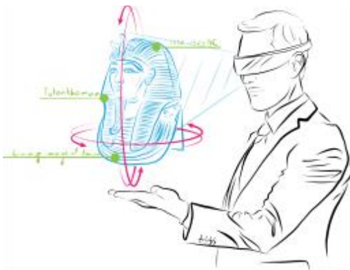
Fig. 4: HoloMuse.exploration augments virtual and physical objects with visual hooks displaying information and leading the visitors' gaze.

This mode allows museum visitors to explore exhibitions with an end device like smartphone or glass wear. Users receive interactive, 3D-multimedia information about key objects and navigate within the exhibition space by gestures. An example could be enabling visitors to read hieroglyphs and provide translations to them in relation to old Egypt objects. Virtual content-pins on objects reveal detail information and therewith foster personal interpretation. This may prompt the visitor to fill mental gaps, to ask questions by engaging with the exhibited object or trigger associations and memories related to visual hooks or entry points (see Fig. 4). A learning mode enables to trigger interactive challenges and explorative task while directly engaging the visitor with the original physical or a digitized virtual object (see Fig. 6).