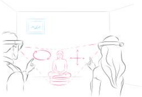
Fig. 8: In the HoloMuse.curating.room visitors and museum professionals are able to place collection items in an augmented physical museum space. Either as learning tool or for planning new exhibitions.

One scenario could be preceded by a real museum visit where users mark their favorite objects on a mobile museum guide. At the end of the exhibition the visitor receives AR glasses, e.g. a Microsoft HoloLens, and places objects in a “curating room” – also in collaboration with others. For visitors, the design of such a personal exhibition increases the active engagement with cultural artifacts. It could also be taken home as memory of a museum visit which can be displayed on smart devices as well as AR and VR devices and shared with friends and family.