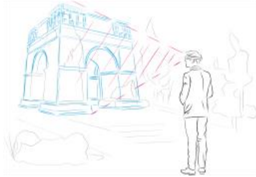
Fig. 3: HoloMuse.immersive.spaces enable the exploration of a historic place or a future scenario in the present physical environment.

Moreover, one can take a virtual fieldtrip in the physical world and explore, for example, a virtual reconstruction of a monument that has become merely a ruin in present times (see Fig. 3). This allows immersive experiences of a possible past. Also, future scenarios can be experienced: one could for example visualize the transformation of an existing landscape due to climate change 100 years from now, and therewith illustrate the meaning and specific interpretations of research data. Therefore, this mode can also be useful for science communication and vividly mediating research data. The experience of the visitor's physical environment is altered and formed.