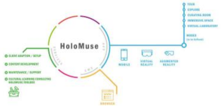
Fig. 1: HoloMuse –overview showing the components of the overall HoloMuse modules including envisaged learning modes.

The following paragraphs will outline concepts of the main HoloMuse “Modes” and give an overview of possibilities provided by AR/VR based museum mediation.