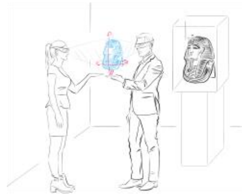
Fig. 5: A guide discusses a virtual object with a visitor during a guided HoloMuse.tour.

Humans learn from humans. Therefore, HoloMuse will be integrated with human mediation and guided tours. During a guided tour through the physical museum space a guide may pass around virtual objects to individuals or a group. This enables visitor interaction e.g. with closer explanations of fragile museum artefacts which otherwise could not be touched in a museum environment (see Fig. 5; a similar feature was also presented by [12]). Additional information or media content can be augmented and discussed directly in relation to the object.