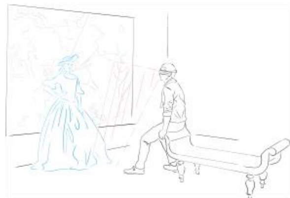
Fig. 2: HoloMuse.immersive.spaces – A fictional character from a painting steps out of the artwork via Augmented Reality technology, acting as a guide giving insights about the work.

Thus, this mode allows to transform every possible existing location into a learning space , augmenting the physical location with new and old knowledge, stories, possible histories, presences and futures. HoloMuse allows to immerse into the depicted fictive world of an artwork. For example, a character of a painting could step out into the gallery space and act as co-present gallery guide introducing the (hi)story of the artwork and context of the depicted scene. The fictive character becomes an „authentic“ authority to give interactive and contextual information and to represent the artistic idea (see Fig. 2).