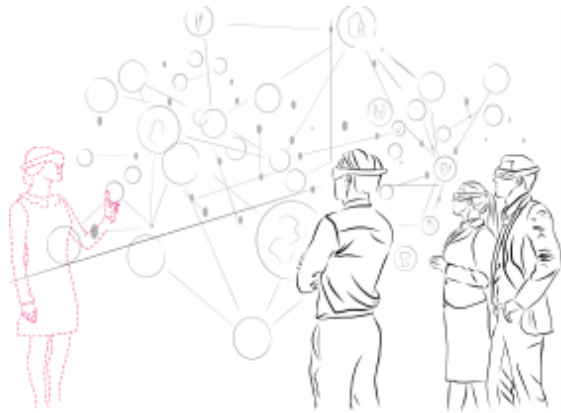
Fig. 7: The HoloMuse.virtual.laboratory enables a co-present exploration of research data or simulations in physically dispersed spaces as well as co-creative knowledge generation.

up a whole range of possibilities for interlinking digital humanities research directly with museums, their collections, exhibitions as well as informal cultural learning. Latest research becomes interactively available to life-long learners, involving the visitors in co-creative knowledge generation processes around the data on multiple devices (see also [13]). This offers benefits for both museums and researchers, binding back the research to the museum as trusted information source.