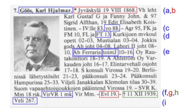
Fig. 2. A biographical entry in the register book with examples of extracted data fields.