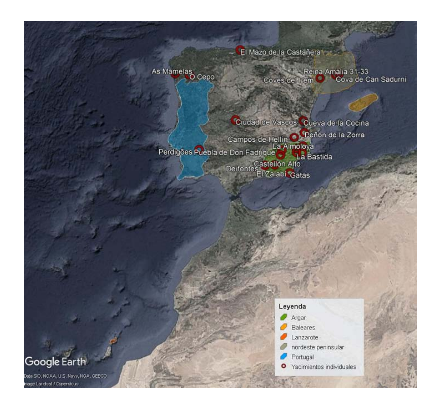
Figure 1 - Archaeological sites and study areas presented in the Proceedings.

Among the papers analyzing single-site C14 date series and those analyzing a regional chronology (Fig. 1), these proceedings mention more than 2300 data, some of which were previously known, but many published here for the first time. We believe this close link between published and unpublished data is particularly important, because the large amount of chronometric information that has been generated over 70 years of research must be reused and critically analysed in the light of new results.