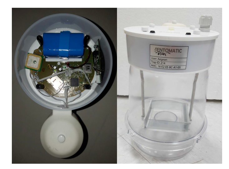
Fig. 2 (LEFT) Embedded electronics. (RIGHT) The electronic McPhail trap.