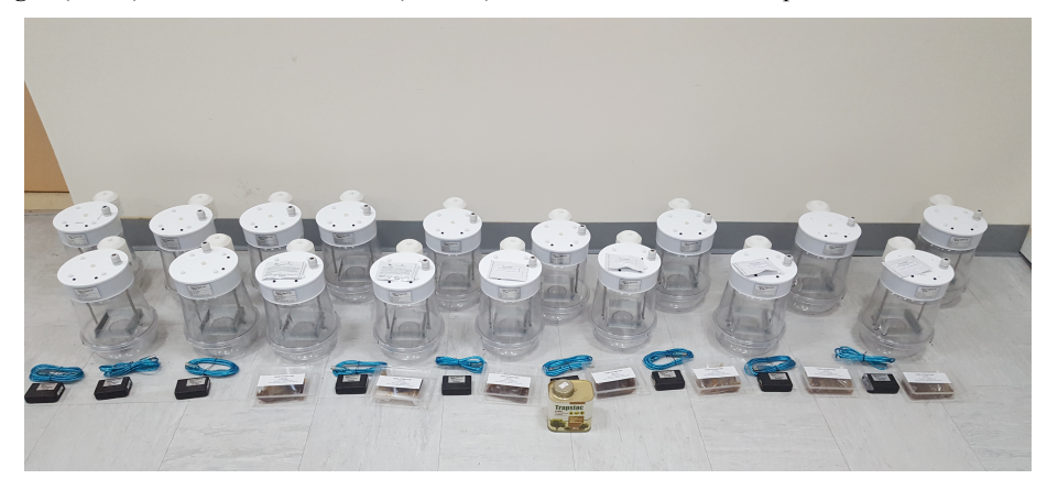
Fig. 3 Mass production of the electronic McPhail trap has started.

We cover the walls of the McPhail traps in Fig. 3 with a transparent sheet of plastic on which we apply a transparent thin layer of glue. As a means for verification data, to validate the automatic counting module, we compare the insects' stack in the glue and the reported results on the server. We further examine the recordings that are stored in the SD card to assess the situation. See also Table 1.