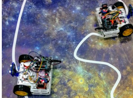
Fig. 2. Robots T-Bots during presentation of the one of projects.