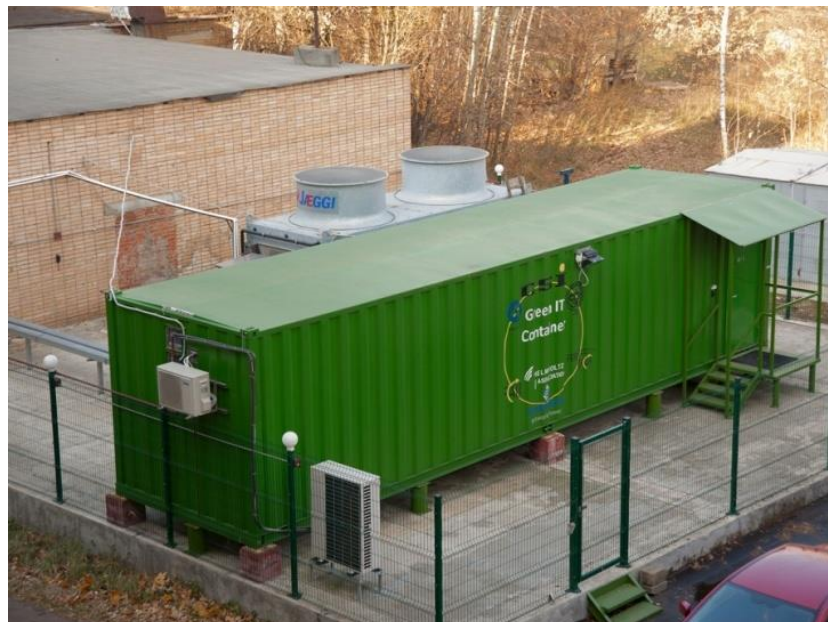
Figure 1. ITEP-FRRC HPC facility

In 2011, group of enthusiasts from GSI and ITEP came forward with a proposal to strengthen the IT infrastructure available for FAIR-Russia. Rosatom and Helmholtz approved the proposal which aims at building a super-computer center serving as the TIER-1 FAIR center in Russia at FRRC and ITEP with an excellent IT network between the Russian institutes. Funded by Helmholtz, a mobile container with high density water cooled racks [1] coupled to an exterior water cooling tower has been designed for the climate of Moscow and has been transported to the FRRC/ITEP. As of September 19, 2014, this High Power Computing Center (HPC) has been successfully commissioned and is now fully operational with 10240 cores, interconnected with Ethernet and Infiniband networks. For theory groups we have 5 special servers equipped with 8 (each) GPU accelerators, with 40 TFlops peak performance. The HPC center is also equipped with a 1080 TB mass storage system. Supercomputer container is shown in Figure 1.