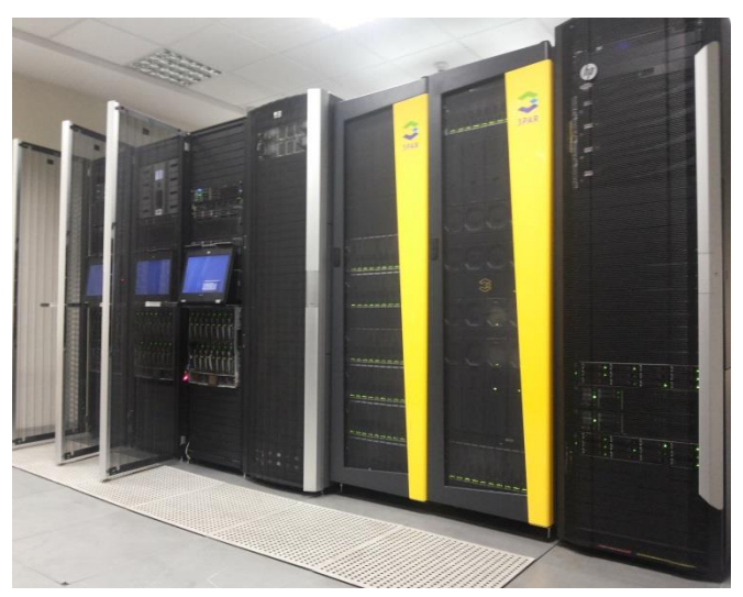
Figure 1. Data Center NULITS

Requests for the allocation of computing resources for the implementation of scientific calculations constantly increase.