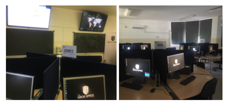
Fig. 7. The Hack Space Laboratory