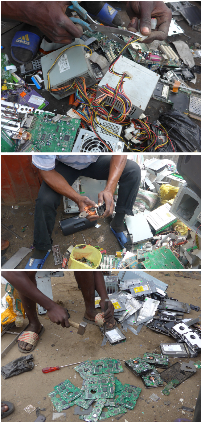
Fig. 1. Dismantling of electronics

The tools used to dismantle electronics are simple, such as scissors, pliers, screwdrivers, hammers, and cold chisels (see Fig. 1). Scissors are mainly used to separate cables from other components. The other tools are used interchangeably, depending on the design of the electronics and the availability of tools.