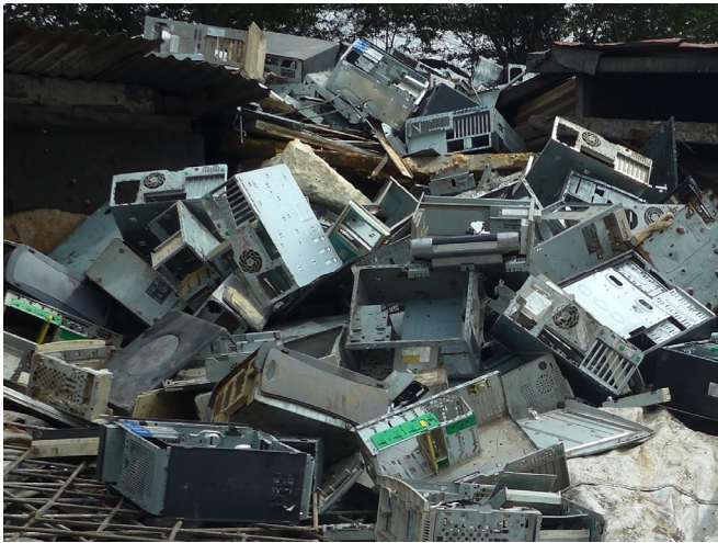
Fig. 3. Disposing of computer chassis

The mobile phone batteries have most often a different route than the rest of the devices: These often recirculate several times in second-hand markets in the city. As a result, the majority of mobile phones that reach Agbogbloshie no longer have batteries, and workers dismantling the devices do not have regular buyers for the batteries. Thus, the few mobile phone batteries that get to Agbogbloshie are usually thrown away in the scrap yard. These can later be picked up by scavengers to be resold in second-hand markets. Otherwise, they remain in the area, falling out of the recycling system.