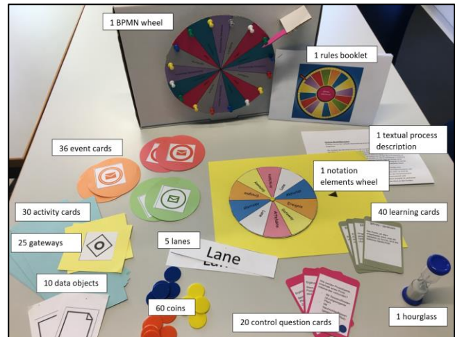
Figure 3: Content of a BPMN wheel game box

We implemented the prototype according to the concept discussed above. Figure 3 illustrates the elements of a BPMN wheel game box.