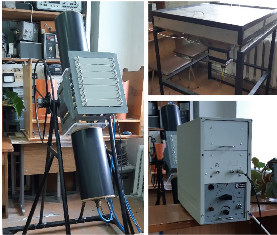
Fig. 2. Laboratory setups developed for the astroparticle course. Left: The telescope for studying the secondary component of cosmic rays. Top right: The stand for studying the fluctuations of ionization losses. Bottom right: The stand for study the main characteristics of photomultipliers (PMT).

In the frame of this course three laboratory setups (see Fig. 2) have been developed to familiarize students with the astrophysics detectors. Students perform measurements on these setups, and analyze and interpret the data using knowledge obtained on the lectures and seminars.