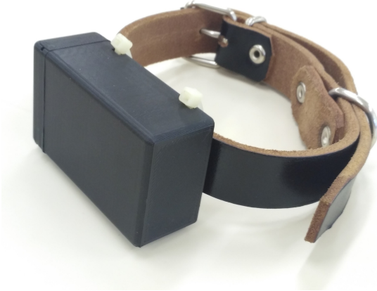
Figure 1: The collar device.