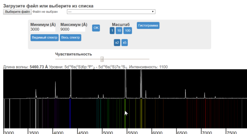
Figure 2. The interface of the comparative analysis of IS ESA spectra. The upper spectrum is the experimental spectrum of the mercury lamp downloaded from a CSV file. The lower one is the spectrum of the neutral mercury atom from the system database.

In addition to the ability to load custom spectra for the analysis, the system has a number of demonstrational experimental spectra, for example, spectra of mercury, hydrogen, sodium lamps, etc.