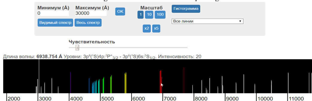
Figure 1. The interface of the service for constructing spectrograms of IS ESA during operation with spectrum K I.

Figure 1 shows a screenshot demonstrating the features of work with spectrograms of IS ESA.