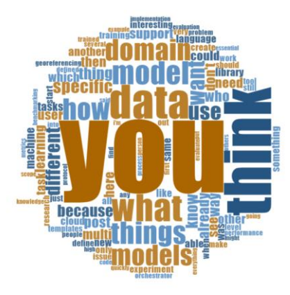
Figure 3. Word cloud from transcripts

The data collected was tough to transcript because the brainstorm sessions were used to structure all the participants understanding the ML tool, user, and features. Therefore, sometimes participants did not make complete sentences, or the sentences were incomprehensible. As mentioned in the Data Analysis session of this paper, we started the data analysis with content analysis [20] but changed to discourse analysis [18] to analyze the data. But while analyzing word frequency, we generate the word cloud presented in Figure 3. The most frequent word was "you" which was used by participants to present their ideas.