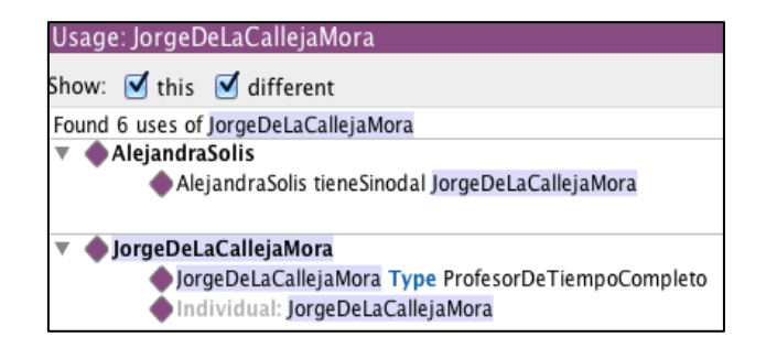
Fig. 3. Information about collaborative work of two users.

Figure 4 shows the ontology metrics for the posters' collection. Note that the number of axioms is 2985 and that there are 396 ontology instances (individual account).