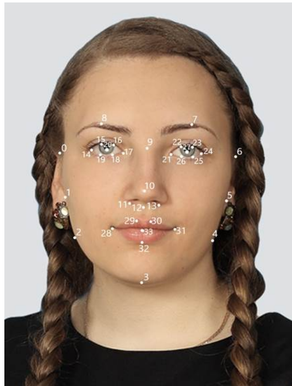
Fig. 1. Used anthropometric points.

19 basic anthropometric parameters were selected to compare faces, that involved 34 key points of the face 1. The distance between the centers of the eyes is the basis in relation to which all face parameters are determined.