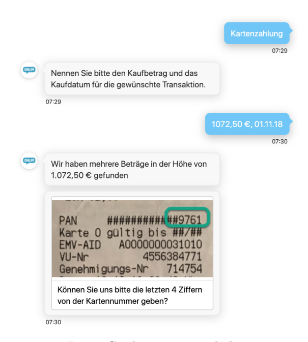
Fig. 1: Card transaction dialog

As mentioned at the beginning of this section, the outcome of the PAYONE project is a chatbot that can handle questions concerning bills, card transactions, and payouts. The following screenshots give an impression on the card transaction dialog. In Figure 1 the user requests information for a card transaction ("Kartenzahlung"). To be able to help the user, the chatbot needs more information like the amount and the date the transaction was done ("1072,50, 01.11.18"). Based on this information DeRool searches for a transaction that matches. If there is more than one transaction, the user needs to enter the last digits of his card number.