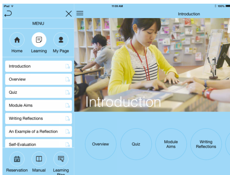
Figure 1: The app designed for SDLL

The idea of transitioning from paper- to electronic-based materials came with the university's transition to a paperless curriculum in 2015. As the university provided iPads to each student and staff from then on, the creation of a purpose-built iPad app (Figure 1) specifically for the modules seemed opportune. As Lammons et al. [2] put it, the aim of the app was to “capitalise on the affordances of the available technology to enhance transformative learning” (p.343). Apart from supporting students' SDLL, the use of the app was expected to streamline the management system, making it easier to document and keep track of the module processes [2, 4]. With the app, the aim of the modules to promote SDLL was maintained and further reinforced thanks to the design of the app. The app was created following the Framework-for-Action (FFA) model developed by Hughes et al. [9]. The FFA model has three components: replacement, amplification, and transformation. In addition to replicating the paper-based materials (replacement), the app included interactive tools enabling learners to visualize and monitor their learning progress (amplification). It also intended to bring transformation through features allowing smooth reflective communication between learners and learning advisors, and the possibility to document activities and reflections using different options, such as audio and video.