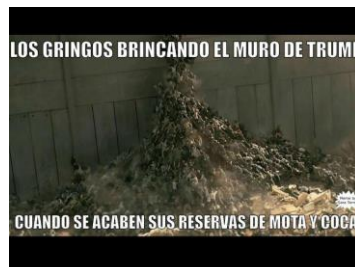
Fig. 6-7. A meme uses a frame from the movie World War Z that represents Americans jumping the wall on search of drugs in case the wall is built.

Memes that deal with the border in Mexico also feature the recurring topic of “El Chapo Guzmán”, a drug lord that escaped a second time from a Mexican federal prison in 2015 by digging a mile-long tunnel, to the embarrassment of Mexican authorities. This was an embarrassment for the Peña Nieto presidency. Another meme relating to the topic of the drug trafficking war, uses a still image from the movie World War Z , that shows a group of zombies climbing like ants over the wall in the Gaza strip, and the meme comments that they would be Americans climbing into Mexico in search of the illegal drugs they cannot get if the actual border were shut down.