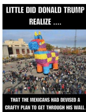
Fig. 1. Image of a piñata similar to a Trojan horse to satirize the invasion of Latin America to the United States of America.

The border is an “open wound” (as Mexican writer Carlos Fuentes said) that was opened after the War of 1847 and resulted in Mexico losing half of its territory. Currently, the wall functions as a political membrane barring the “expelled citizens” of the southern Mexico border from the economic benefits of the North. Memes thrive on contentious ideas ridiculing both sides of the spectrum. Some memes expunge the gravity of a two-thousand-mile concrete wall in a region that shares cultural traits, languages, and natural environment, a region that cannot be domesticated with symbolic monuments to animosity. Memes are rhetorical devices that convey absurd situations, as in a popular meme that shows a colorful piñata on the edge of the border, a meme that infantilizes the State-funded project of a fence and sets in motion a discussion of the issues at hand – global economic disparities and human migrations.