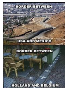
Fig. 5. A meme that contrasts the hyper guarded border of the USA and Mexico and the line between European countries that share similar economies.

Memes work as a mechanism of instant approval or rejection. For example, the “like” button on Facebook is a way of casting a ballot on a particular view of the world and the “share” button turns content into marching vehicles of propaganda, displaying banners of social change or social scorn to convince others and recruit new converts. Another example of a meme shows the hyper-guarded political division on the border with barbed wire and border patrol agents. To counterpoint, in contrasting photo we see a simple marking in the cobble stones that divide two European countries, showing that the US and Mexico border is a militarized zone that does not take into consideration the coexisting cultures in this region or the combined multimillion dollar economy that, if measured as a single region of US and Mexican states, is a larger zone than Western Europe, a territory with linguistic hybridizations, sister cities, such as El Paso and Ciudad Juárez, that have interdependent economies, and transborder cities (Tijuana-San Diego) that – if seen from a satellite perspective – conform a single cultural unit far away from other cities of cultural influence in their own respective countries.