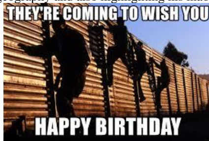
Fig. 3. A meme of a group of men crossing the border, the text signals the idea of an invasion to produce fear.

Yet, the apparent humorous and innocent chiding critique of the meme does have an impact in steering political outcomes – as the 2016 American election has shown – as does the intense propaganda, aka digital warfare, engaged in by Russian interests to demerit Western democracies. In short, the creation of these memes (whether by foreign or domestic interests) functions as an instrument of division, splitting public opinion and opposing democratic or liberal ideologies. “Divide and conquer” works efficiently for global political interests in the open waters of the internet, which allow for the free flow of information and viralization of memes, particularly ones that incite deep erosions of civility and play with stereotypes, racism, sexism, and the fear of the other. For example, in the following meme, we are presented with the idea of a Latin American invasion by presenting immigrants attempting to cross the border, a group of men presented as a threat that needs to be controlled. This image, taken out of context, helps to support the idea of fortifying the border wall, that is, promoting Trump. Or in the next image, a sharpie correction of the political lines that divide Mexico and the United States uses Trump’s mistake of calling the State of Colorado as one that borders with Mexico (and the so-called “Sharpiegate”) to invalidate the President’s efforts to build a wall by lacking basic knowledge of geography and also highlighting his inability to accept error.