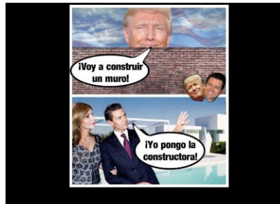
Fig. 6. A meme that parodies the former Mexican President suggesting a construction company to build the US/Mexico wall that was benefited with contracts during his administration in Mexico. It reads: “I will build a wall! And his Mexican counterpart responds: I will select the construction company!” (My translation).

Memes that deal with the border in Mexico also feature the recurring topic of “El Chapo Guzmán”, a drug lord that escaped a second time from a Mexican federal prison in 2015 by digging a mile-long tunnel, to the embarrassment of Mexican authorities. This was an embarrassment for the Peña Nieto presidency. Another meme relating to the topic of the drug trafficking war, uses a still image from the movie World War Z , that shows a group of zombies climbing like ants over the wall in the Gaza strip, and the meme comments that they would be Americans climbing into Mexico in search of the illegal drugs they cannot get if the actual border were shut down.