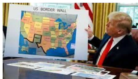
Fig. 4. Meme of President Trump that parodies the “sharpie gate” and the mistake of him saying that Colorado has a border with Mexico.