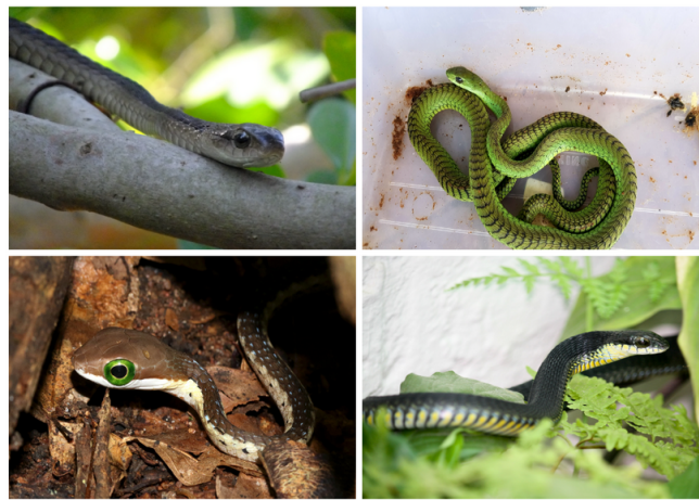
Figure 1: Four images of the Dispholidus Typus snake species with high visual deviation characterized by age and gender depicting an instance of high inter-class variance in the data set

As part of the LifeCLEF-2021 [9], an evaluation campaign aimed at data-oriented challenges related to the identification and prediction of biodiversity, SnakeCLEF-2021 [10] is an image-based snake identification task. For this challenge, a large data set with 414,424 RGB photographic images belonging to 772 distinct snake species, taken in 188 countries is provided. Additionally, geographic metadata comprising of country and continent information is provided to facilitate classification. The data set is split into a training subset with 347,406 images, and a validation sub-set with 38,601 image, both having the same class distribution. The data set is highly imbalanced with a heavy long-tailed distribution. The most frequent class is represented with 22,163 images while the least frequent class by a mere 10 images. A large number of classes in combination with a high intra-class variance (depicted in Figure 1 and low inter-class variance makes this an exigent machine learning classification task.