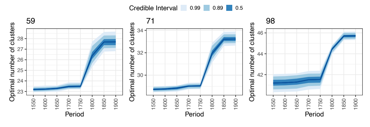
Figure 1: Posterior predictive distribution of the optimal number of clusters by period, showing different credible intervals, while varying the sample size over 59 (left), 71 (middle) and 98 (right) items, corresponding respectively to the 10%, 50% and 90% percentiles. The visualization is based on 200 samples from the MCMC posterior draws.

Figure 1 depicts the posterior predictive distribution of the optimal number of clusters using a counter-factual triptych plot, statistically controlling for the sample size at different percentiles. Overall, we observe a clear monotonic effect, resembling an s-curve, with a leap starting in the 1750 bin. The shape of the effect remains stable across the three sample size percentiles. Due to the positive linear effect of sample size on optimal number of clusters, the range of the outcome (i.e. the y-axis) increases across plots in the triptych. Moreover, the distribution of uncertainty varies from plot to plot. At smaller sample sizes, the uncertainty in the predicted number of clusters is larger towards the later time bins, whereas for larger sample sizes the most uncertain predictions come from the earlier bins. This is likely due to the fact – depicted in Figure 2 – that the sample size in pre-1800 bins is always smaller than in post-1800 bins. However, by counter-factually controlling for sample size, we can observe that the statistical model predicts a constant effect shape regardless of the sample size.