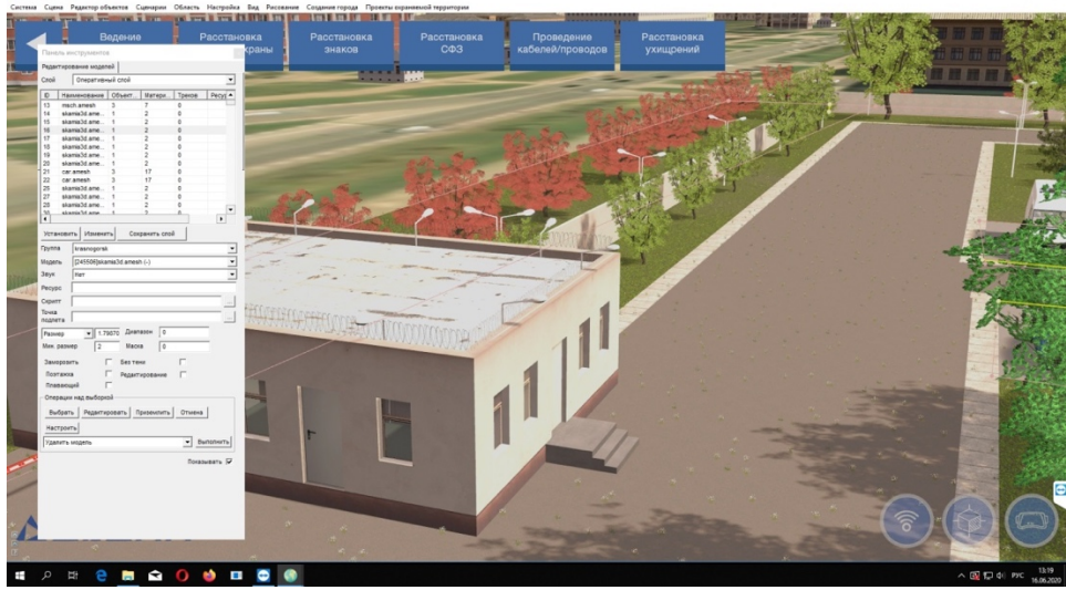
Figure 1. Checkpoint

The site should have a checkpoint for access control (Fig. 1).