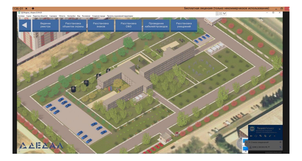
Figure 3. 3D Site Model

The current situation will be determined by comparing the data received from the video camera with the site model.