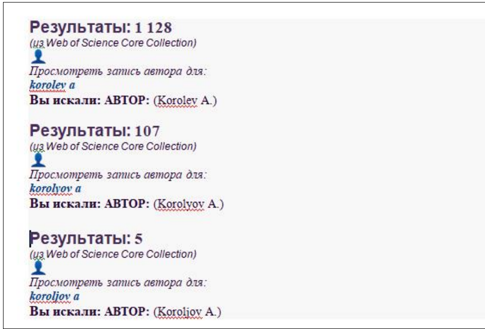
Figure 2: Various transliterations of the “Королев” surname in WoS CC