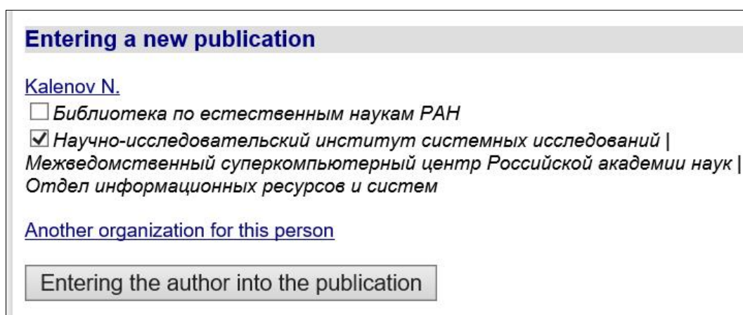
Figure 5: Entering the author and his affiliation in a new publication

The first step of publication data input is entering its authors in the order presented in the publication. First, the required author is searched for in the system database by entering the initial fragment of the surname into the search line. The system will display a list of found persons (surnames are active links), as well as a link "New person". If the person you need is in this list, then you have to activate the corresponding link. The system will show the name of the person and related organizations that were registered earlier (Fig. 5). In the process of entering persons and organizations, you can point to equivalent records.