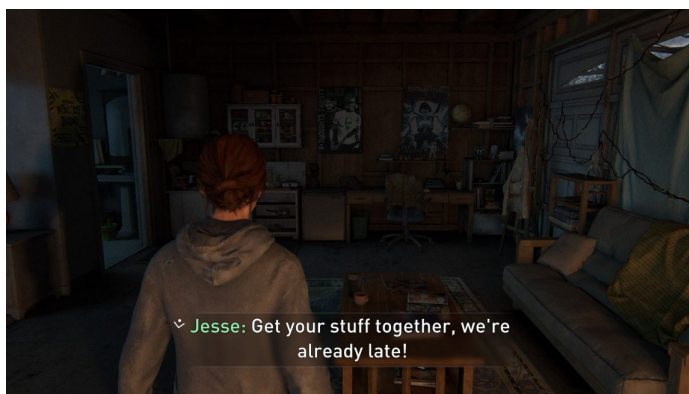
Fig. 1. Subtitles from The Last of Us Part 2

In the part of hearing accessibility we find options such as an arrow that activates and indicates the direction from where you have received damage. An element of the HUD that alerts you when enemies are about to detect you. If the player has gotten lost in any area, he will have the possibility to press a button and a visual clue will come out where he has to go. Picking up ammo, crafting ingredients, or other resources displays a notification in the HUD.