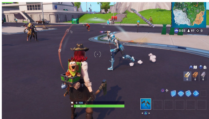
Fig. 2. Sound indicator in Fortnite Battle Royale

are produced is also shown in an approximate way, changing the colors, their intensity and opacity [5].