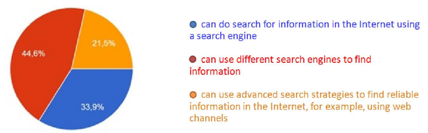
Figure 1 : The sample of the answers of the respondents about the area of "Information and digital literacy".

In the area of "Information and digital literacy" when asked about the ability to search for information, 33.9% of respondents said that they can do search for information in the Internet using a search engine that corresponds to the basic level of the user; 44.6% of respondents said that they can use different search engines to find information that corresponds to the level of an independent user; 21.5% of respondents said that they can use advanced search strategies to find reliable information in the Internet, for example, using web channels that corresponds to the level of a professional user(see Fig.1).