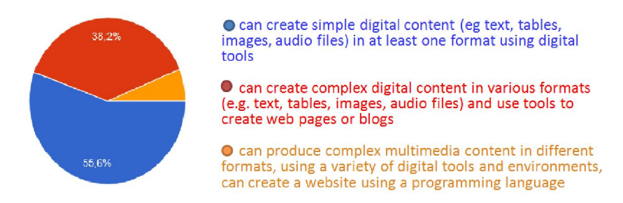
Fig.3. The sample of the answers of the respondents about the area of "Digital Content creation".

When asked about the ability to use the formatting features of content and various tools, 27.6% of respondents said that they can make basic editing of content created by other users (for example, add and remove), which corresponds to the basic level of the user; 63.4% of respondents stated that they can apply basic formatting (for example, insert links, charts, tables) to content created by themselves or other users that corresponds to the level of an independent user; 8.8% of respondents said that they can use the functions of advanced formatting of various tools (eg, merging e-mail, merging documents of different formats, using advanced formulas, macros), which corresponds to the level of a professional user.