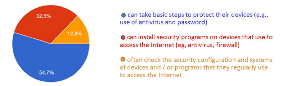
Fig.4. The sample of the answers of the respondents about the area of "Safety".

In the area of Safety , when asked about the ability to protect the system of devices and programs, 54.7% of respondents said that they can take basic steps to protect their devices (eg, use of antivirus and password), which corresponds to the basic level of the user; 32.5% of respondents stated that they can install security programs on devices that use to access the Internet (eg, antivirus, firewall), which corresponds to the level of an independent user; 12.8% of respondents said that they often check the security configuration and systems of devices and / or programs that they regularly use to access the Internet, which corresponds to the level of a professional user(see Fig.4).