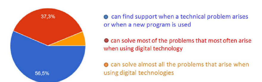
Fig.5. The sample of the answers of the respondents about the area of "Problem solving".

In the area of "Problem Solving", when asked about the ability to solve problems that arise when using digital technologies, 56.5% of respondents said that they find support when a technical problem arises or when a new program is used that meets the basic level of the user; 37.3% of respondents said that they can solve most of the problems that most often arise when using digital technology, which corresponds to the level of independent user; 6.2% of respondents said that they can solve almost all the problems that arise when using digital technologies, which corresponds to the level of a professional user(see Fig.5). When asked about the ability to choose and use an appropriate digital tool or service to solve non-technical problems, 42.6% of respondents know that digital tools can help solve problems that correspond to the basic level of the user; 36.9% of respondents stated that they can use digital technologies to solve non-technical problems, which corresponds to the level of an independent user; 20.6% of respondents said that they can often choose the right tool, device, application, software or service to solve non-technical problems that corresponds to the level of a professional user.