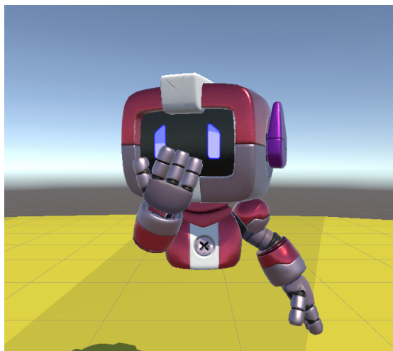
Figure 1: Our robotic NPC manifesting the emotion of sadness at a medium level of intensity.