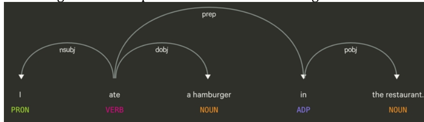
Figure 3: Syntactic Analysis Result of a Sentence “I ate a hamburger in the restaurant.” using spaCy

We use travel blog data collected from TravelBlog †† , which is one of the largest travel blog web sites, to automatically collect food-related terms. It hosted over 700,000 blog entries. In travel blogs, for example, there are descriptions of meals at travel destinations, such as “I ate a hamburger in the restaurant.” By focusing on “eat” or its past tense “ate” and using a syntactic analyzer to extract its object, it is thought that terms related to food can be easily collected. In the case of the above sentence, using spaCy ‡‡ , a Python library for natural language processing, we can extract “a hamburger” from the parsed result as shown in Figure 3.