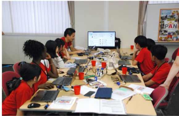
Figure 1: Children communicating in groups using machine translation

In our previous study [2], we investigated the role of facilitators in a real-world intercultural children's workshop by analyzing conversation log data. The workshop was an annual workshop called KISSY (Kyoto International Summer School for Youth) organized by non-profit organization (NPO) Pangaea, where children from diverse countries come together to participate in group activities. Each intercultural team in the workshop is assigned an adult facilitator to provide support.