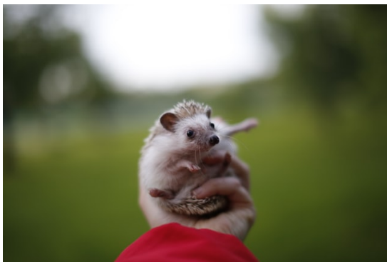
Figure 5: Result of the query “un topolino” (eng: a small mouse) on the Unsplash25K dataset.