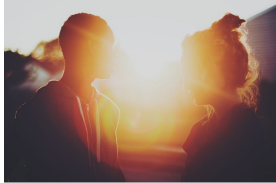
Figure 3: Result of the query “una coppia al tramonto” (eng: a couple at the sunset) on Unsplash25K.

the concept of “snow” and the one of “two dogs”. 13 We anecdotally find moderate numeracy capabilities during empirical evaluation, with sufficient ability to identify up to three distinct or repeated elements inside images, with a steep drop in coherence when more than three elements are present. Given the likely low number of training points depicting more than three subjects in a scene, we impute this finding to implicit bias in the training set. Figure 3 shows a similar performance for “una coppia al tramonto” (a couple during sunset), where the model could identify two people with sunlight in the background. A similar query, but with a mountain as a background, can be found in Figure 4. Despite the overall good performances, the model is inevitably subject to limitations and biases. For example, Figure 5 shows an image of a tiny hedgehog retrieved using the query “un topolino” (a tiny mouse). We leave a more thorough exploration of biases and stereotypes learned by the CLIP-Italian model to future work.