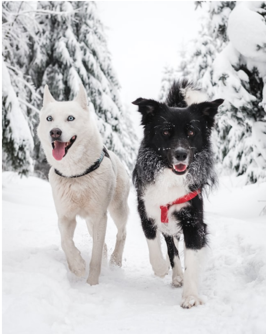
Figure 2: Result of the query “due cani sulla neve” (eng: two dogs on the snow) on Unsplash25K.

tasks we have been testing. Note that the performance for zero-shot ImageNet classification of the CLIP-Italian model (trained on 1.4 million image-text pairs) are lower than those shown in Radford et al. [1] (trained on 400 million image-text pairs). However, considering that our results align with those obtained by mCLIP, we think that the quality of the translated image labels most probably impacted the final scores.