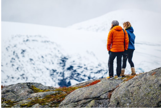
Figure 4: Result of the query “una coppia in montagna” (eng: a couple in the mountains) on Unsplash25K.