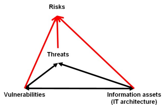
Figure 1: Dependencies between risks, threats, vulnerabilities and information assets

The general approach to security management outlined in the standards is a risk-based approach. Therefore, the main goal of security management is to minimize risks. The ISO/IEC 27005 standard defines risk as “the impact of uncertainty on targets”, and note 6 to this definition states: “information security risk is related to the potential opportunity for threats to exploit the vulnerability of an information asset or information assets and, therefore, cause damage to the organization”. Furthermore, in the standard context of ISO/IEC 27005, “vulnerabilities may be associated with the properties of an asset that can be used in a manner or for a purpose other than that intended when the asset was acquired or manufactured”. Simply put, a vulnerability is a weakness in an asset or group of assets that can be exploited by one or more threats, but a threat that does not have the corresponding vulnerability cannot cause a risk. And finally, “a risk assessment determines the value of information assets, the relevant threats and vulnerabilities that exist (or may exist), the controls in place and their impact on the identified risk, the potential consequences and, finally, the priorities of new risks and classify them according to risk assessment criteria established in the context of creation” [23]. The diagram shown in Figure 1 represents the dependencies between risks, threats, vulnerabilities, and information assets.