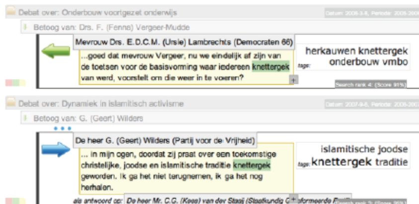
Figure 2: Who uses offensive language in the Dutch parliament?

which we can click and inspect. To follow this semantic link corresponds to implementing the semantic search approach outlined in Section 2. Identifying how often the term ‘ knettergek ’ is used per political party, person, or year is a clear use case for exploratory search in the form of (fuzzy) faceted search. Notice that this implicitly corresponds to the construction of a more complex search strategy under the hood. Once relevant speech portions are identified, we may request a list of people or political parties as result, which illustrates the importance of allowing arbitrary retrieval units as discussed in Section 2.